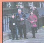
Where are they? page 15