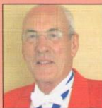
Parish Profile page 2

Although the Restoration Appeal has now ended, there are still a few areas awaiting completion in the next few months. This means that anyone who wishes to commemorate someone or something special can still donate monies for the completion of these areas.